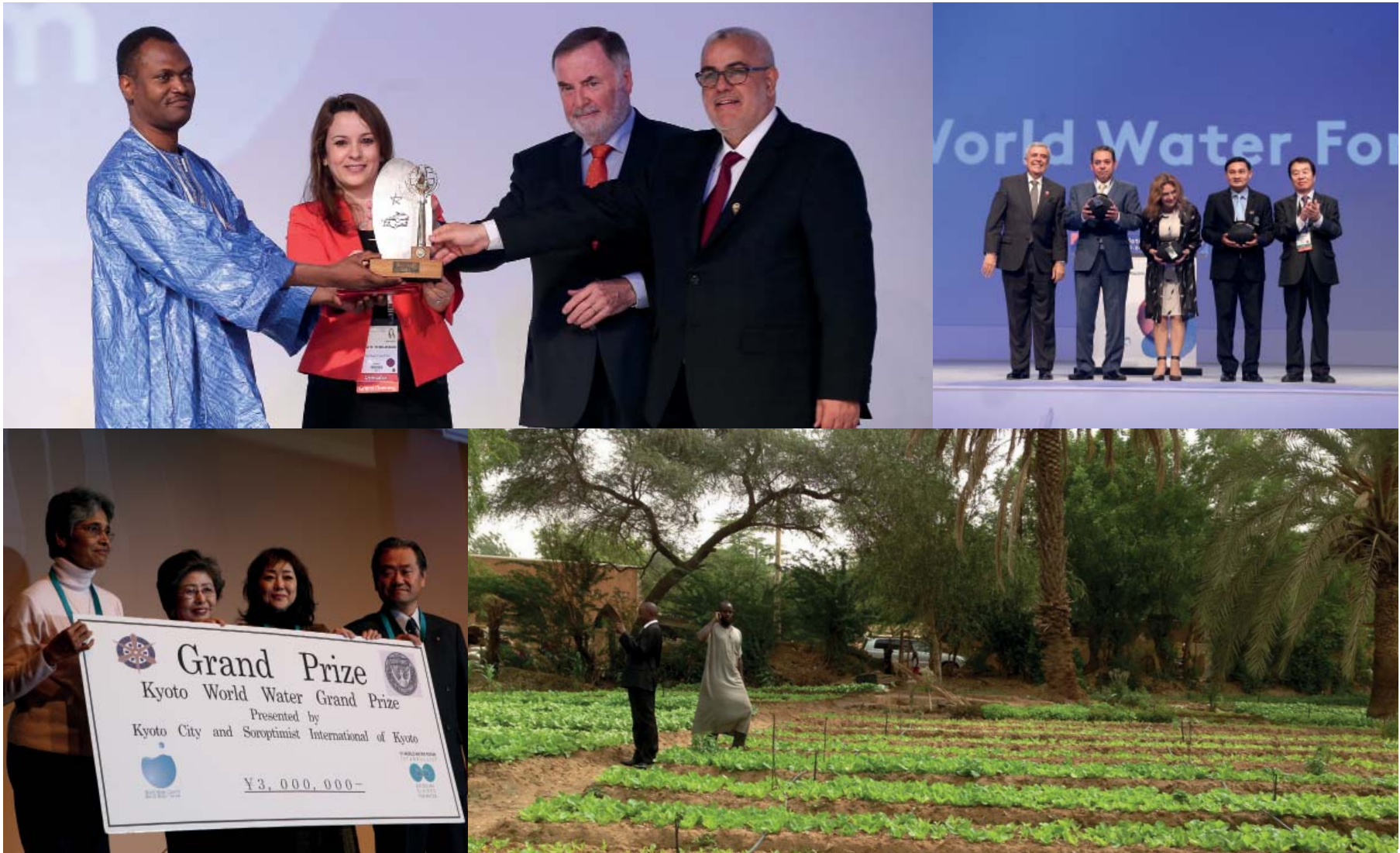
From top left to bottom right: Laureates of the King Hassan II Great World Water Prize, the Mexico Water Prize, and the Kyoto World Water Grand Prize, at the 7 th World Water Forum award ceremonies. Tele-irrigated fields, the Tech-Innov Niger solution for remote irrigation, which won the 2015 King Hassan II Great World Water Prize.