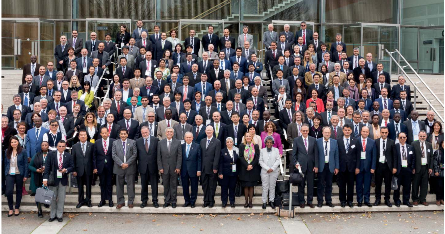
Members of the World Water Council, 7 th General Assembly, Marseille, 13 November 2015.