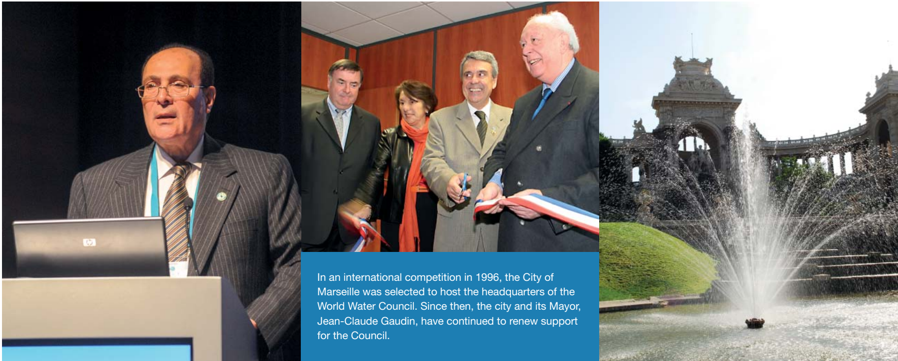
In an international competition in 1996, the City of Marseille was selected to host the headquarters of the World Water Council. Since then, the city and its Mayor, Jean-Claude Gaudin, have continued to renew support for the Council.

“Water is essential to all life, all ecosystems and all human activity... The effective management of the world’s water resources will contribute to the strengthening of peace, security, cooperation and friendly relations among all nations in conformity with the principles of justice and equal rights.”