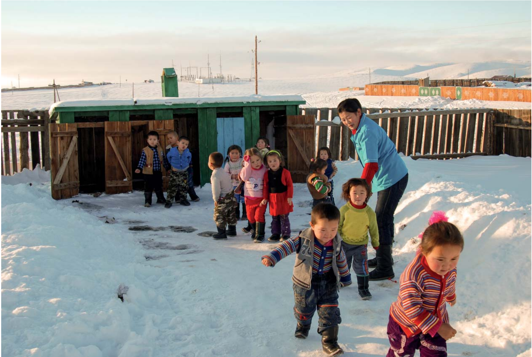
Boreholes, latrines and water rooms, Mongolia.